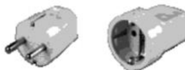
Schuko plug and socket